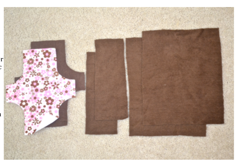
FYI Girls receive 2 base units so one can be worn while the other is washed and set out to dry. Liners can be changed throughout the day when saturated.